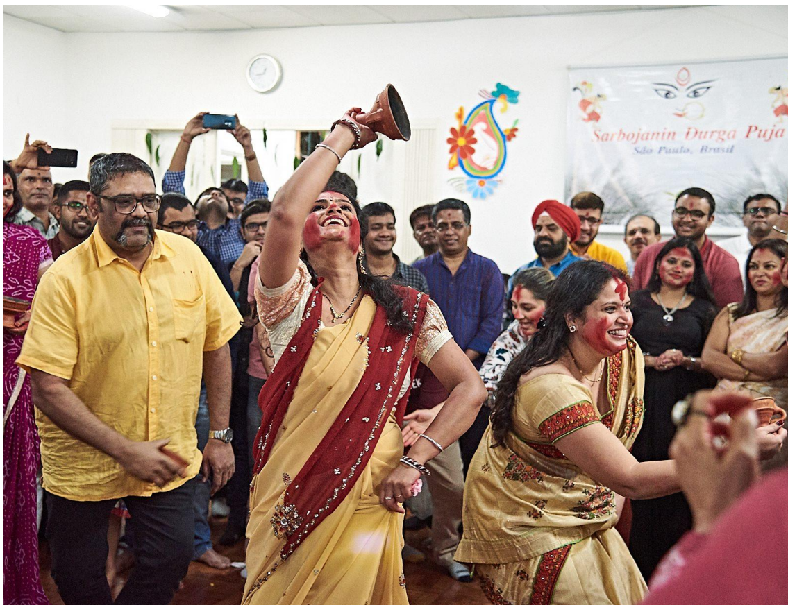
Images of Durga Puja celebration at the Centre organized by the Durga Puja Committee and Indian Association São Paulo. The puja is organized annually.